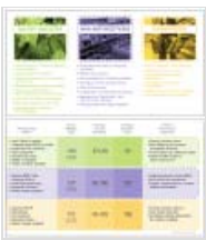
Henkel Shopper Segments